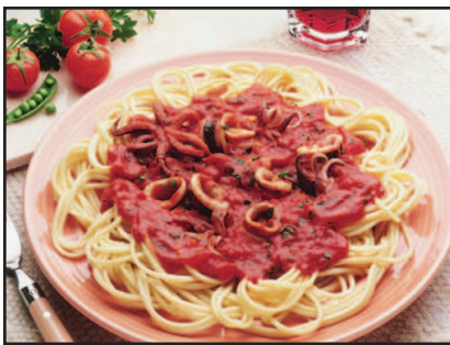
Tomato sauce with particulates

In the food industry, a number of products include ingredients that are susceptible to degradation due to shear or mechanical manipulation