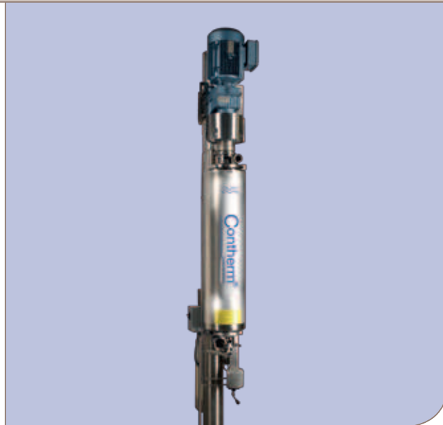
Contherm SSHE model 6x6

Product enters the cylinder through the lower product head and flows upwards through the cylinder. At the same time, the heating/cooling media travels in counter-current flow through the narrow annular channel between the heat transfer wall and the insulated jacket.