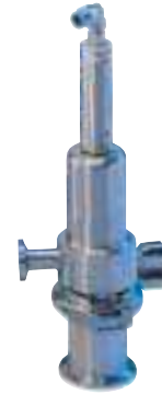
GHBV Vacuum Breaker