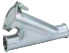
45 BYMP Ball Check Valve