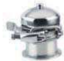
B44MP Vacuum Breaker

Model B44MP is available in 1-1/2" and 2" Tri-Clamp connection. It uses a teflon plug and o-ring design. Positive pressure keeps the o-ring sealed