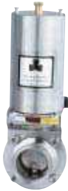
LKB Butterfly – with actuator