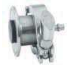
Air Blow Check Valve