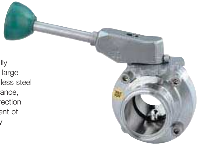
LKB Butterfly – with multi-position handle

For manual operation, Alfa Laval offers a complete range of handles including the new LKB multi-position lockable handle.