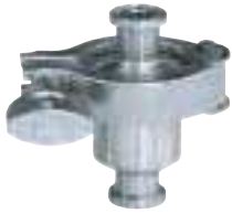
C45MP Fractional Check Valve