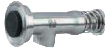
660 Fractional Sampling Valve