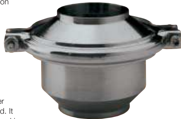
LKC Disc Check Valve

Our 660 model sampling valve has a 1/2" Tri-Clamp connection and a 1/4" hose or 1/2" Tri-Clamp outlet. It also features a PTFE plug.