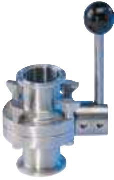
LKB Butterfly – with two position handle