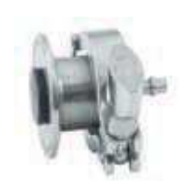
Air Blow Check Valve