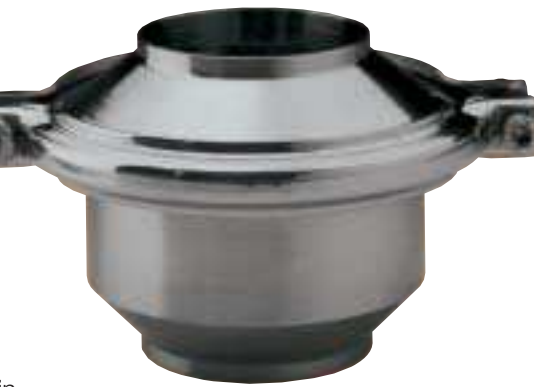
LKC Disc Check Valve

Our 660 model sampling valve has a 1/2" Tri-Clamp connection and a 1/4" hose or 1/2" Tri-Clamp outlet. It also features a PTFE plug.