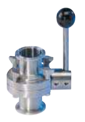
LKB Butterfly - with two position handle