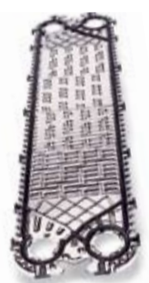
Front WideStream Plate