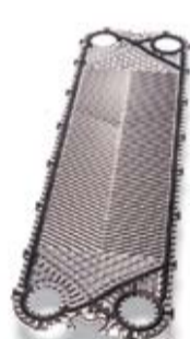
Front Gemini Plate

The FrontLine range from Alfa Laval represents the most advanced plate heat exchanger technology available for dairy, beverage and processed food applications. Designed exclusively for these demanding applications, the FrontLine range provides specific benefits to the food processor, including: