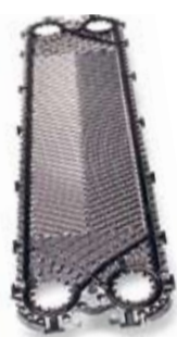
Front Standard Plate