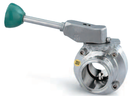
LKB Economical on/off routing valves for low and medium viscosity product.