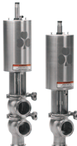
Tri-Clover Unique 7000 – Long stroke For processing suspended solids or high viscosity products.