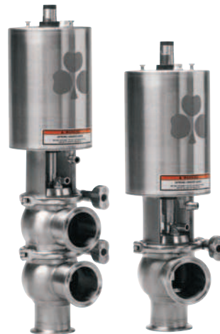
Tri-Clover Unique 7000 - Aseptic valve Built for aseptic operating conditions such as high sterilization temperatures.

This aseptic version best illustrates the modularity and interchangeability of parts available. While the bonnet and stem configurations can vary, the diaphragm, body(s), actuator, clamps, stem guide bushing are all standard and common interchangeable components. As a result, less spare parts are needed which translates into low parts inventory and ultimately lower cost of valve ownership.