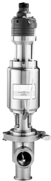
Tri-Clover 771 control valve Pressure control valve for sanitary applications.

The LKB is also available in a low pressure version for pressure up to 75 psi. The LKB-LP is only available as a manually operated valve.