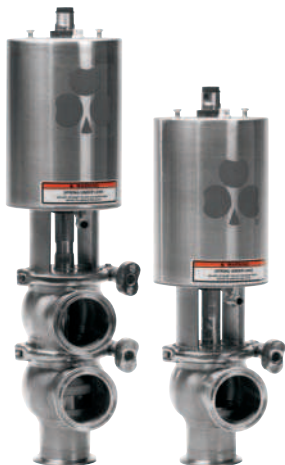
Tri-Clover Unique 7000 - Standard valve The latest Tri-Clover innovation from installations of over one-million Alfa Laval and Tri-Clover valves.

When developing this valve, initial input was given to keep the cost of ownership low. Alfa Laval listened by designing the Tri-Clover Unique 7000 valve so customers can easily maintain the valve now and into the future. Looking at the seat ring, a durable TR2 seat is standard which provides enhanced CIP capabilities. An optional elastomer seat ring with controlled seat compression via metal-to-metal contact is available to reduce seat wear further. The actuator – which features a 5-year warranty – is connected to the valve body by a yoke, and all components are assembled using Tri-Clamps. Alfa Laval even delivers each valve partially assembled for easier installation. Finally, only the Tri-Clover Unique 7000 has a one-piece body with no welds. Having no welds ensures corrosion resistance and minimizes the potential of stress-related valve port and body irregularities.