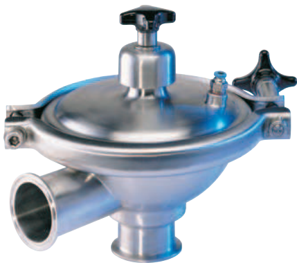
CPM-2 When you need to keep your product under even pressure.

The 771 air-operated control valve is ideal for high volume, sanitary liquid processing applications where precision control of flow rate or pressure is required. Its heavy-duty construction and precision-molded bonnet gaskets ensure positive alignment under severe operating conditions. The 771 valve has a sanitary and flexible design allowing it to be used in a wide range of metering, blending, weighing and filling system applications.