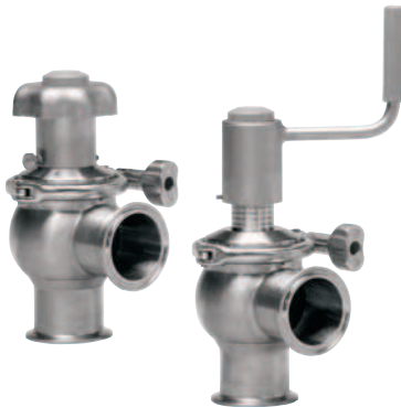
Tri-Clover Unique 7000 - Manually operated valves Manually operated and regulating valves that have the same versatility and hygienic qualities as the entire Unique 7000 range.

Knowing that tank sizes and configurations vary, the body can be turned in any position if the Tri-Clamps are slightly loosened. Valve sizes range from 2” to 4” and are supplied with the tank flange that gets welded directly into the tank.