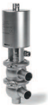
Tri-Clover Unique 7000 – Small Single Seat Valve A fractional seat valve for a wide range of applications.

The Small Single Seat Valve is available in both remotely controlled and manually operated versions.