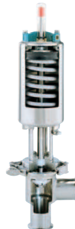
Tri-Clover 700 Series Available in a variety of configuration including throttling, tank outlet and reverse acting - flow diversion.

Two actuators (long and short) fit most 700 Series valves – including a wide selection of shut-off and divert valves. Valves are also available in sizes from 1" to 6" OD so you can build any size valve without increasing inventory requirements. Available normally open or normally closed, actuators can be field-reversed simply by disassembling, repositioning and reassembling.