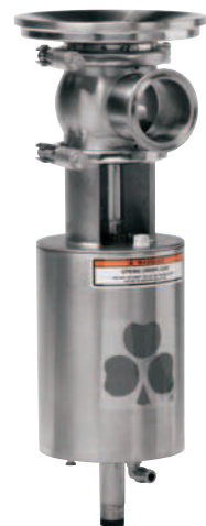
Tri-Clover Unique 7000 - Tank Outlet Designed as a tank outlet valve solution for a variety of tank sizes and configurations.