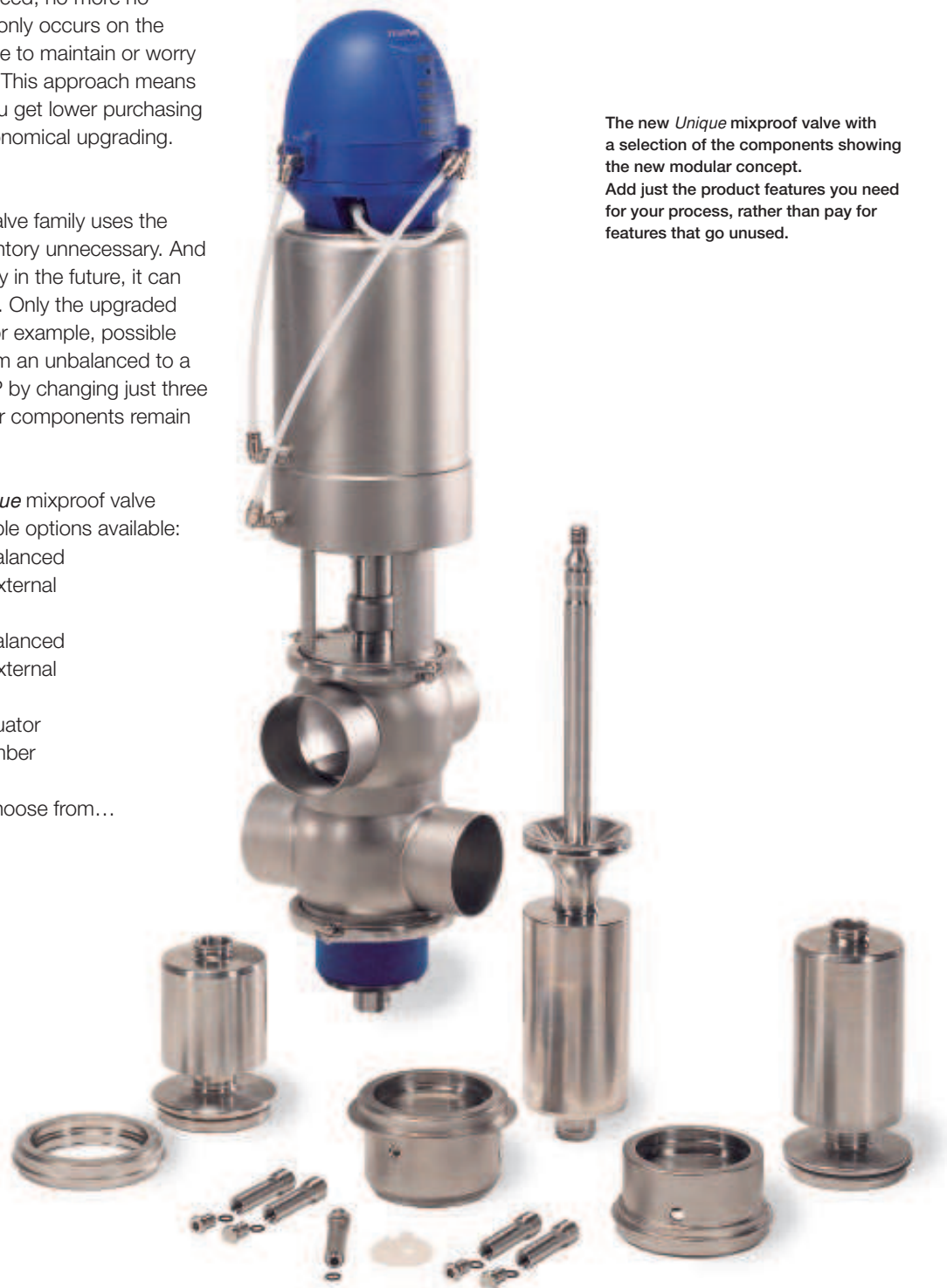
The new Unique mixproof valve with a selection of the components showing the new modular concept. Add just the product features you need for your process, rather than pay for features that go unused.