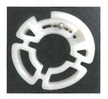
Fast and Easy Installation