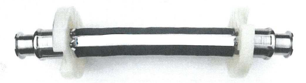
Hose Assemblies available with Şure Seal Crevice Free Hose Couplings™