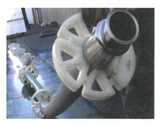
Convenient "Lift and Carry" Feature