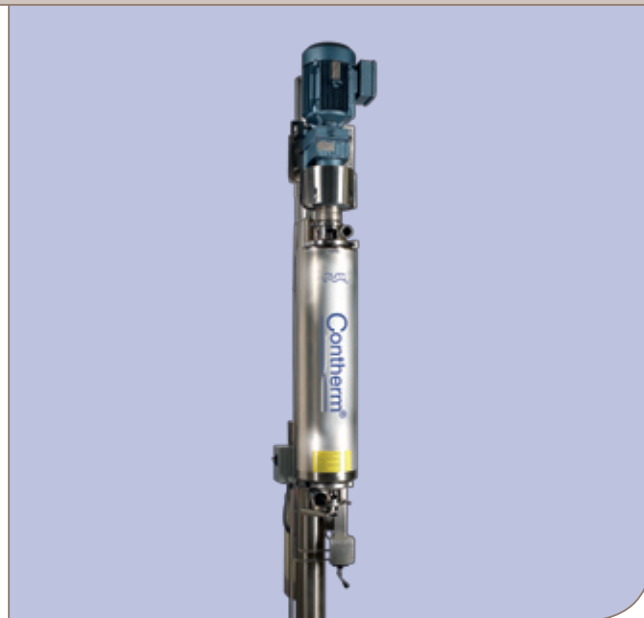
Contherm SSHE model 6x6

Product enters the cylinder through the lower product head and flows upwards through the cylinder. At the same time, the heating/cooling media travels in counter-current flow through the narrow annular channel between the heat transfer wall and the insulated jacket.